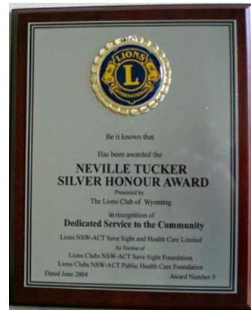
SAMPLE AWARD PLAQUE

AWARD NOMINATION FORM IS ON PAGE 6 OF THIS ISSUE