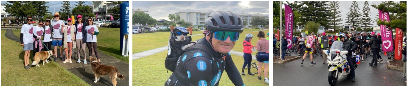
Pictured below from left to right: participants from the 5km walk, cyclists completing the 50km with his dog and a photo of the starting line.

Donateline staff hosted an array of events across the network. Donation Specialist Nurses hosted morning teas for critical care staff to say thank you for their compassion, support and dedication to families who embark on the donation journey. Staff from the broader hospital network were also invited to join these celebrations to start the conversation about organ donation with their colleagues, family and friends. We also thanked the Executive, Media & Communications teams for their support of the 'Great Registration Race'.