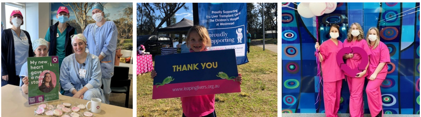
Pictured below from left to right: JHH staff enjoying their morning tea, Leaping Livers Thank You and NSLHD donation nurses in their scrubs.

We also had over 100 Cafes across NSW participate in our #RegisterInTwoSips campaign, delivering QR codes for the Australian Organ Donor Registry with each delicious beverage all week long, linking thousands of people with the to assist with our Great Registration Race goals. We had representation across every LHD in the state!